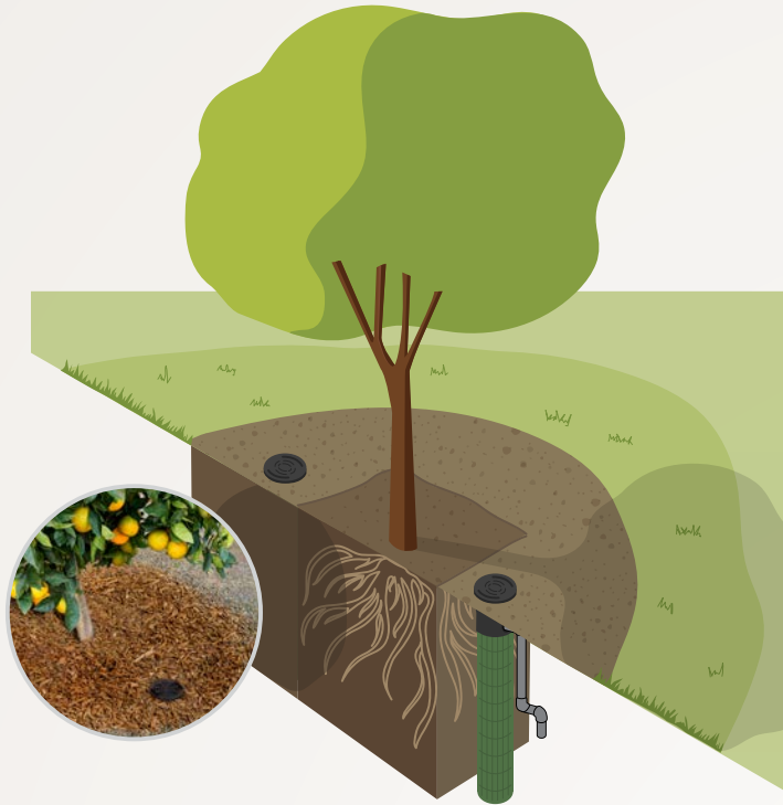
Root Zone Watering System

RZWS can be turned off or modified with pop-up spray heads to apply adequate water for maturing trees.