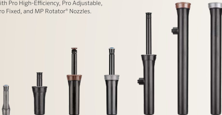
Shown here: PRS40 shrub, Pro-Spray 2", PRS30 and PRS40 4", Pro-Spray 6", and PRS30 and PRS40 12" sprays

All models also include a user-friendly, pull-ring flush cap to keep debris and clogging to a minimum. In addition, Pro-Spray Sprinkler Bodies work with all industry-standard female nozzles, offering maximum flexibility.